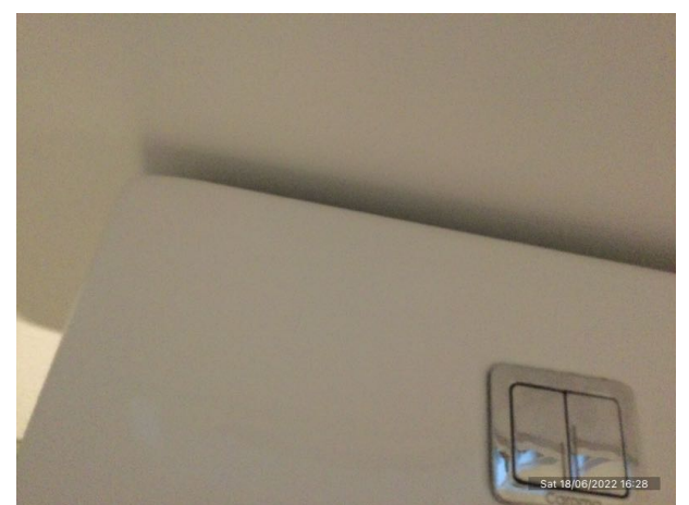
#1 - Ensuite: Overall