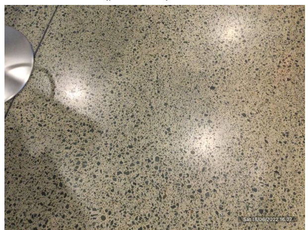
Bedroom 2: Overall (photo 3 of 3)